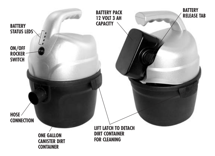
FIGURES 1 AND 2 - Front and Rear views of the Canister Vac